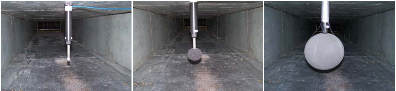
Figure 1: Test set-up in aero/acoustic wind tunnel showing unprotected microphone and fitted with manufactureres standard 60mm unit and ACO pacific model WS-07

Figure 1 below shows the test set up where a baseline untreated, standard diameter windscreen and the ACO Pacific 7 inch screens were tested under stepped quiet airflow only exposure. The attenuation for the windscreens was tested in the duct and in a large anechoic room. Attenuation is defined as the difference in measured level with and without the windscreen in place.